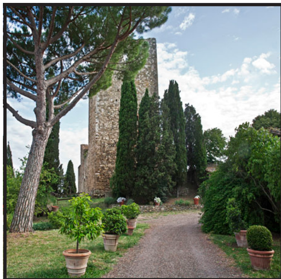
The grounds of Sesti