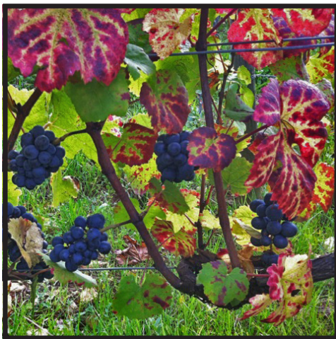
Pinot, ready to be picked

Ofentimes here at the shop a customer will ask if I can recommend a good Pinot. “Of course,” I reply. But what kind of Pinot? Blanc , gris , noir ? Or was it not a Pinot at all that they were interested in, but a Pineau ? Together, grapes known as Pinot and Pineau represent a handful of different varietals, only some of which are actually members of the Pinot family. This sampler covers the obvious ones, such as Pinot Noir, as well as some less likely candidates: Pineau de la Loire, a.k.a. Chenin Blanc, and the light-skinned, spicy Pineau d’Aunis. The Pinot Blanc from Kuentz-Bas is in fact a blend of two different white Pinots: Blanc and Auxerrois. Also worth noting is Pierre Boillot’s Beurot: this is the local name for Pinot Gris, and these vines over fifty years of age represent one of the few remaining plantings of the grape in Burgundy. From a parcel in the heart of the Volnay AOC, Pierre’s Beurot is a piece of history. Enjoy this selection at a generous discount, and find out which Pinot is the one for you.