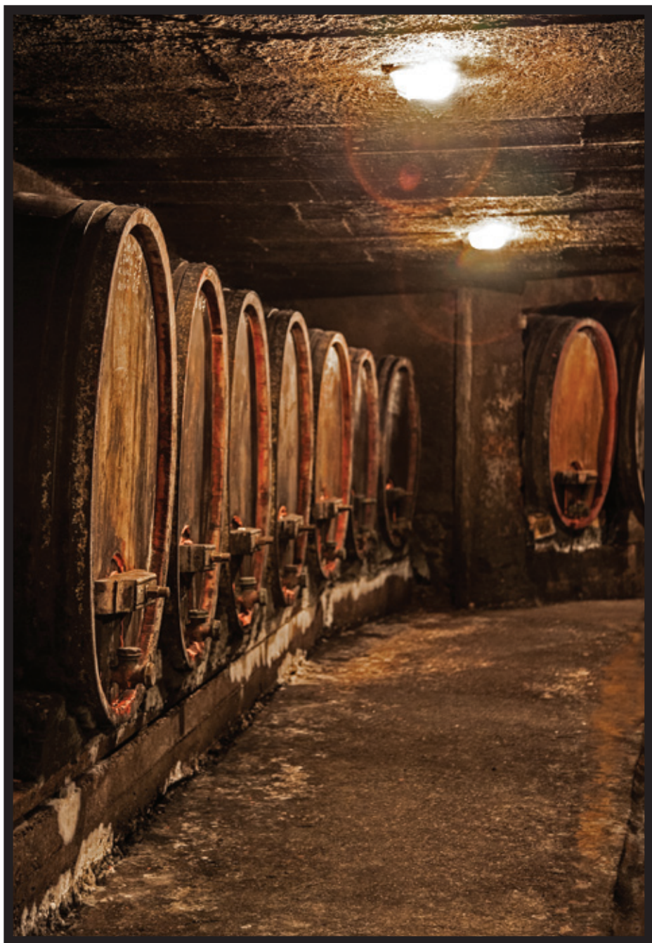
The essential foudres in Clape's cellar