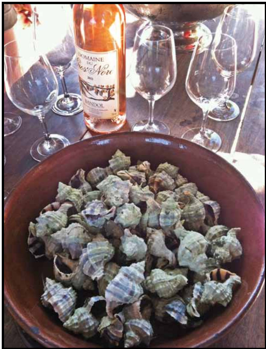
Gros 'Noré Rosé and sea snails