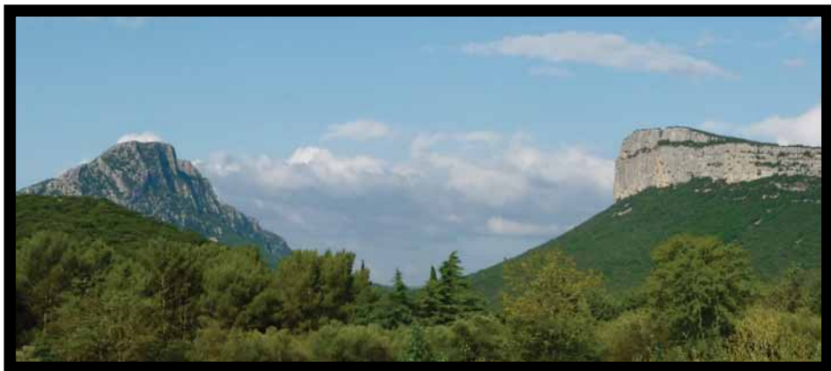
Pic Saint Loup: where that wild Ravaille magic happens