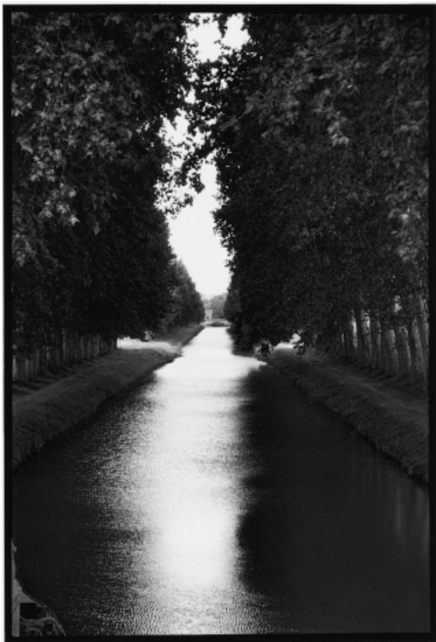
Canal du Midi